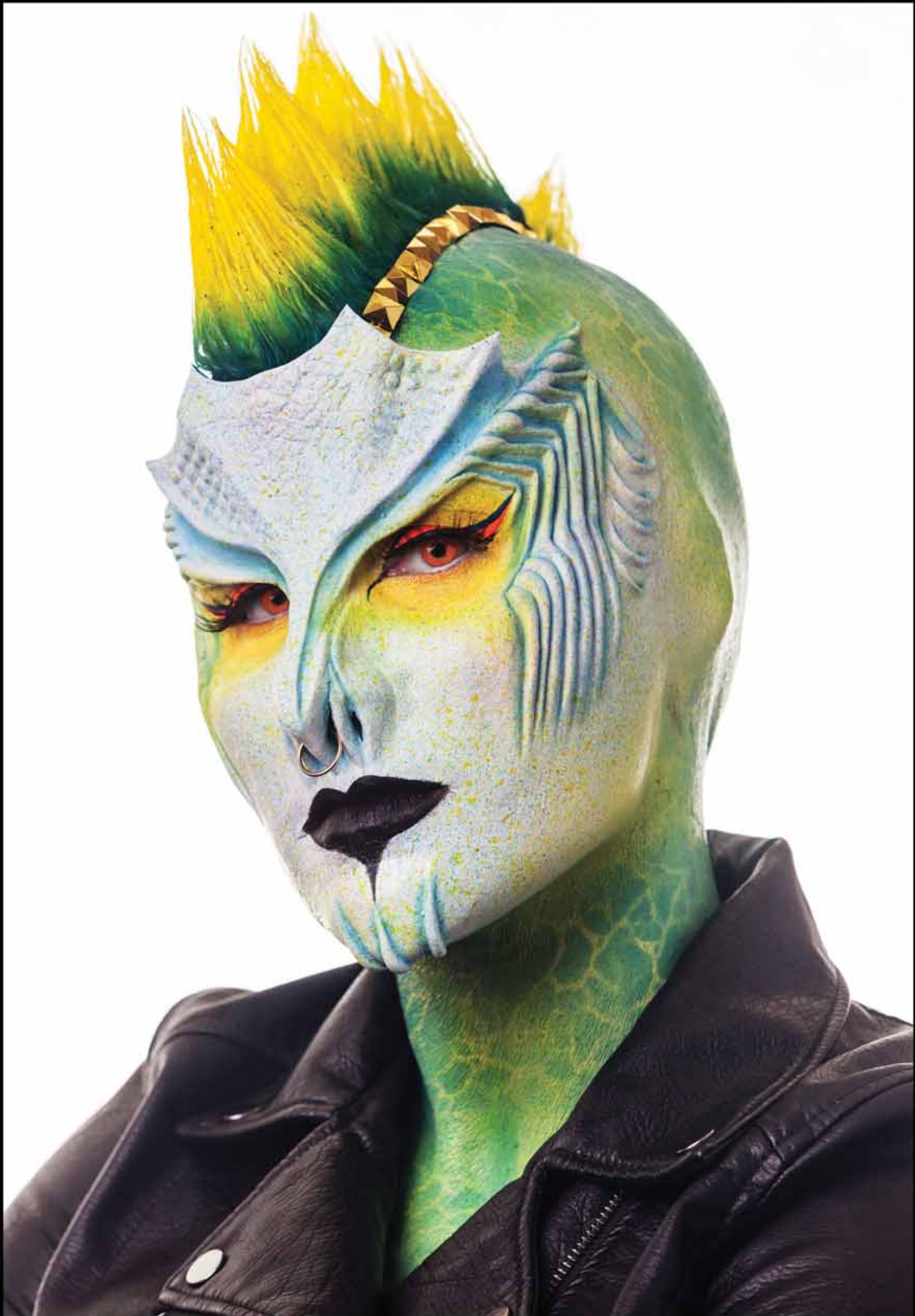
DESIGNED, SCULPTED, FABRICATED, AND APPLIED PROSTHETICS FABRICATED AND APPLIED BALD CAP