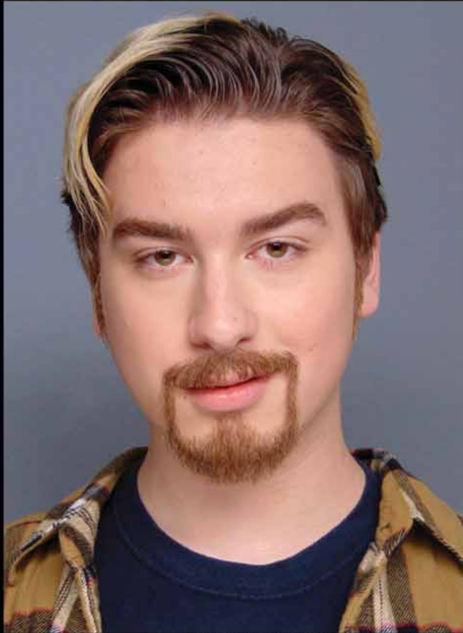
HAND LAID GOATEE AND SIDEBURNS VENTILATED AND APPLIED LACE MOUSTACHE