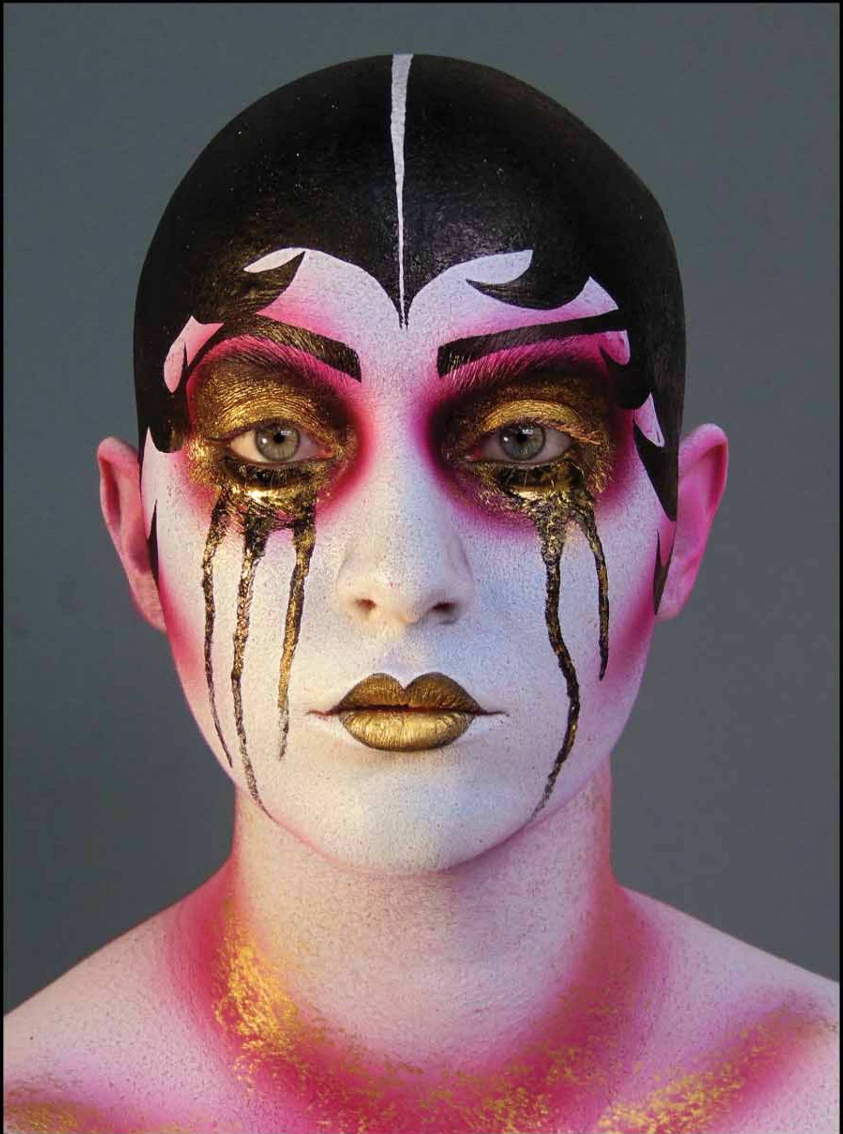
FABRICATED AND APPLIED BALD CAP