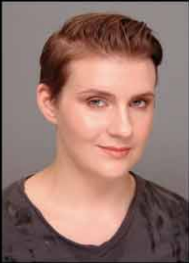
DESIGNED, SCULPTED, FABRICATED, AND APPLIED PROSTHETICS, WITH PUNCHED EYEBROWS HAND LAID BEARD, MOUSTACHE, AND HAIRLINE