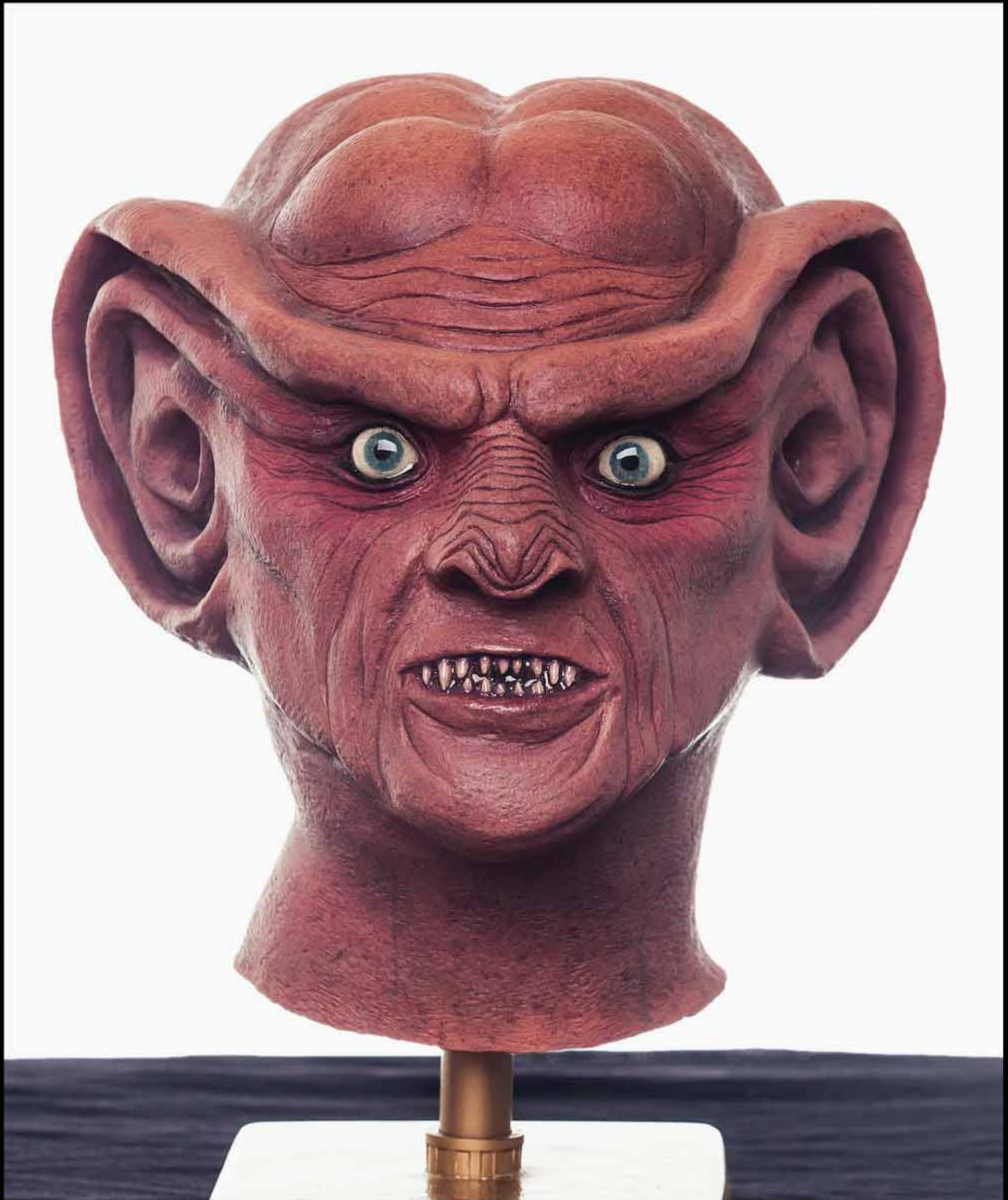
SCULPTED, FABRICATED, AND PAINTED BUST INSPIRED BY QUARK; FERENGI CHARACTER FROM STAR TREK: DEEP SPACE NINE