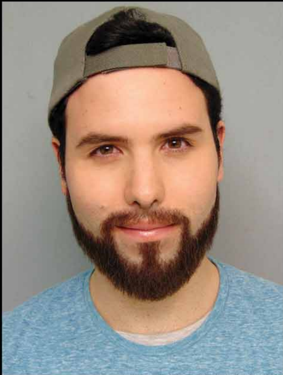
HAND LAID BEARD AND MOUSTACHE