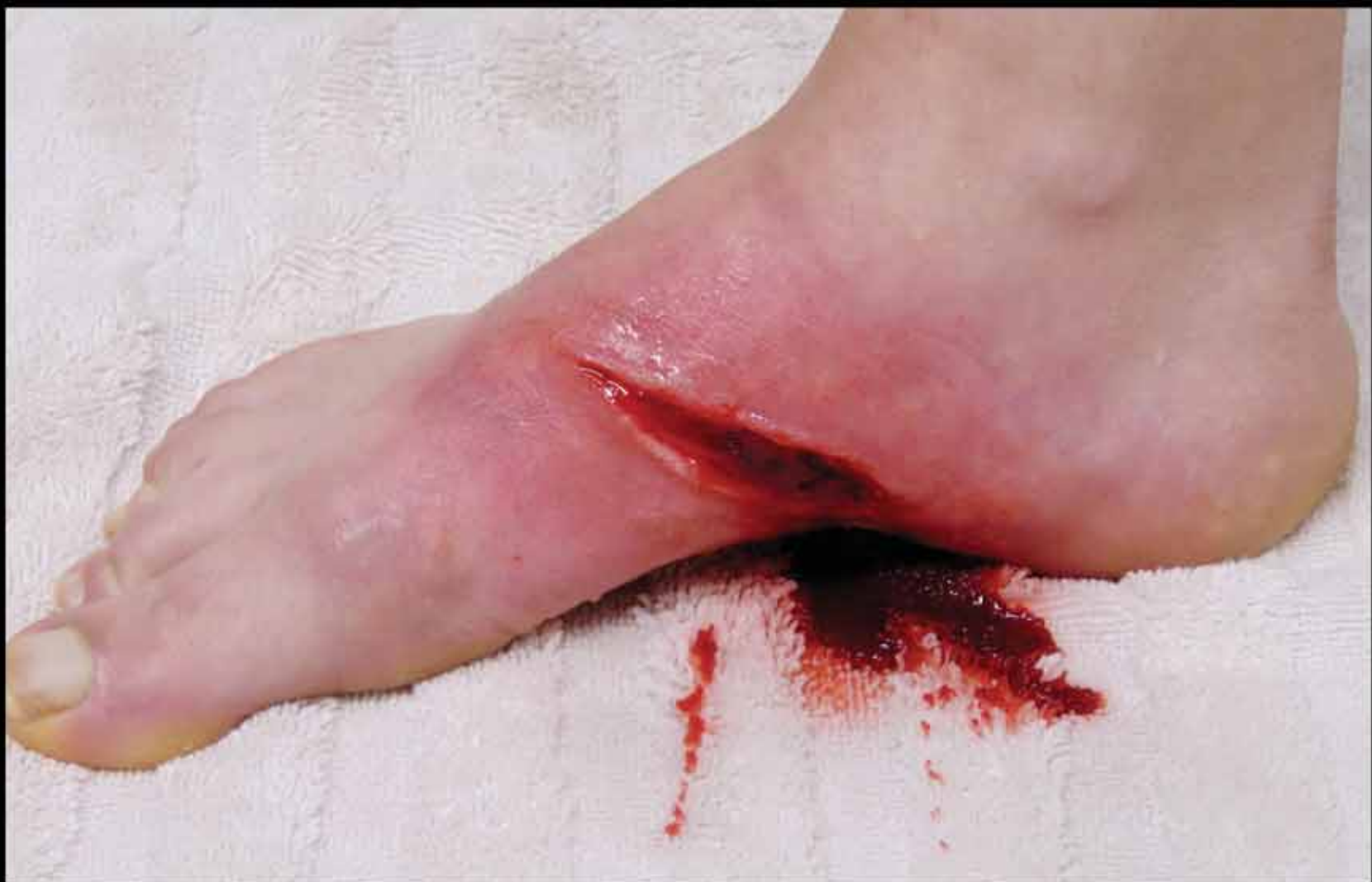
SCULPTED, FABRICATED, AND APPLIED PROSTHETIC INJURIES