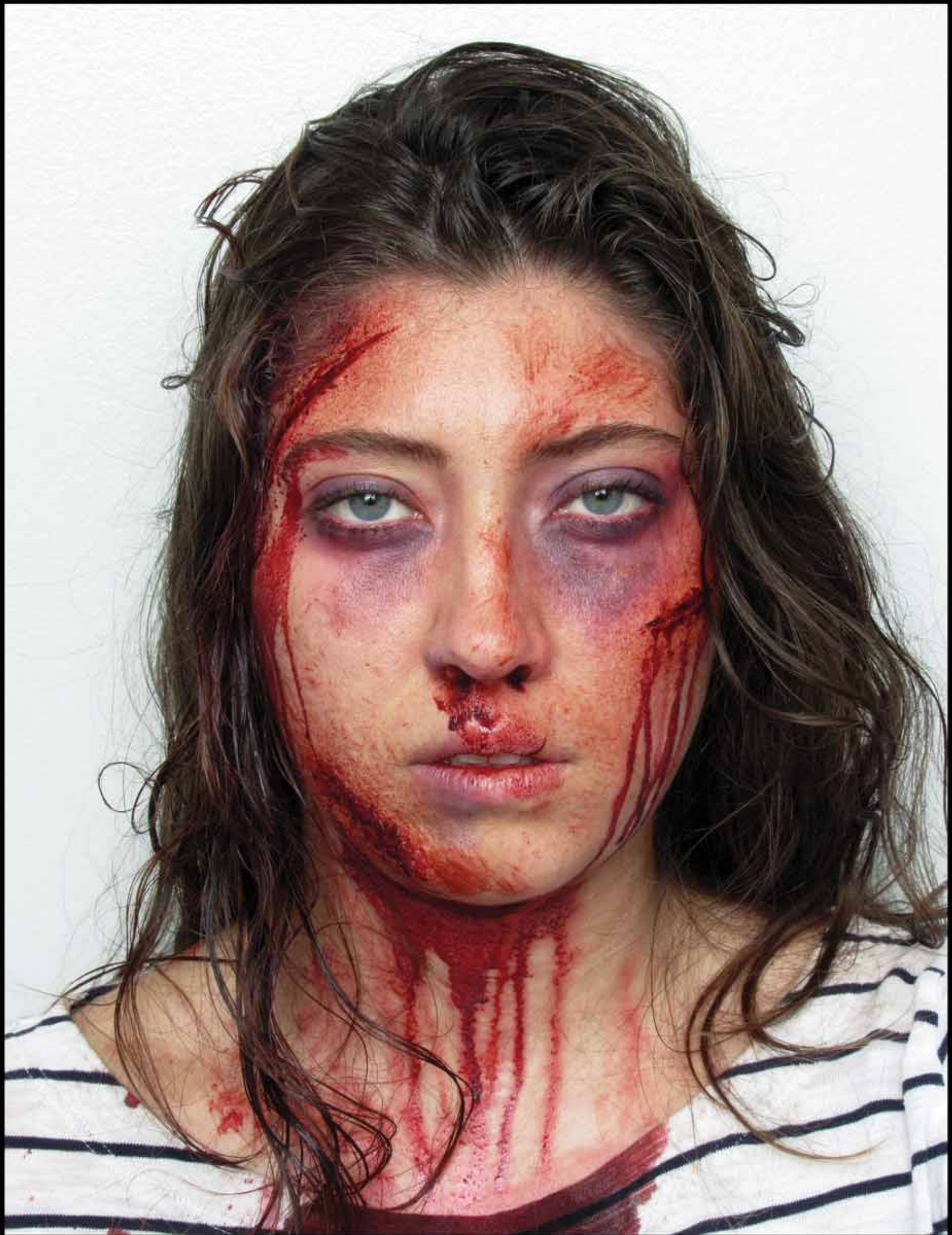
SCULPTED, FABRICATED, AND APPLIED BONDO PROSTHETICS