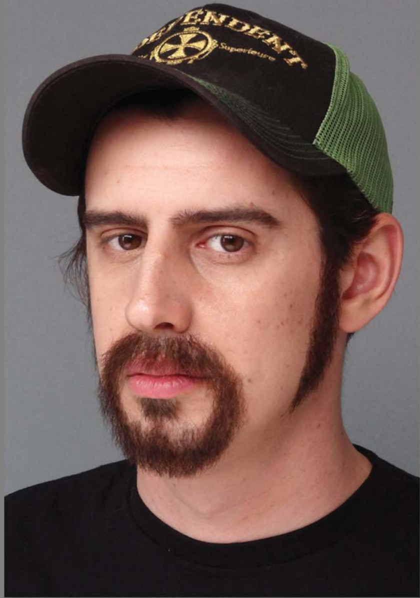
Hand laid goatee and sideburns