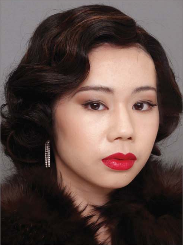
1930s Styled and Applied Lace-Front Wig