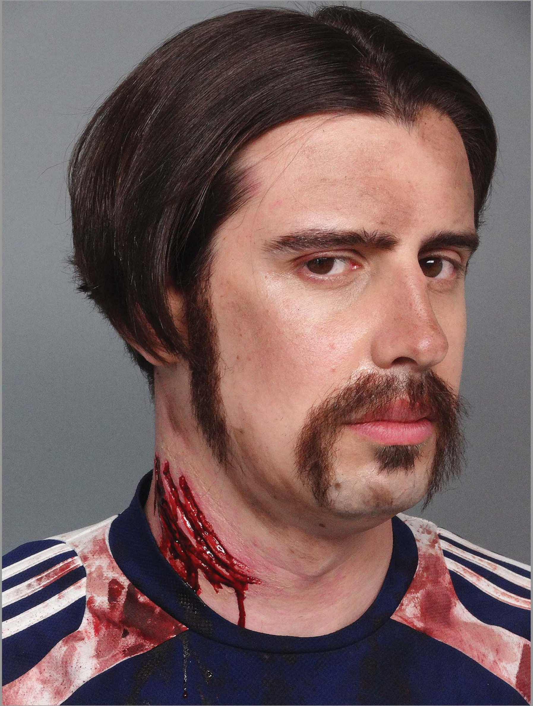
Hand laid Facial Hair