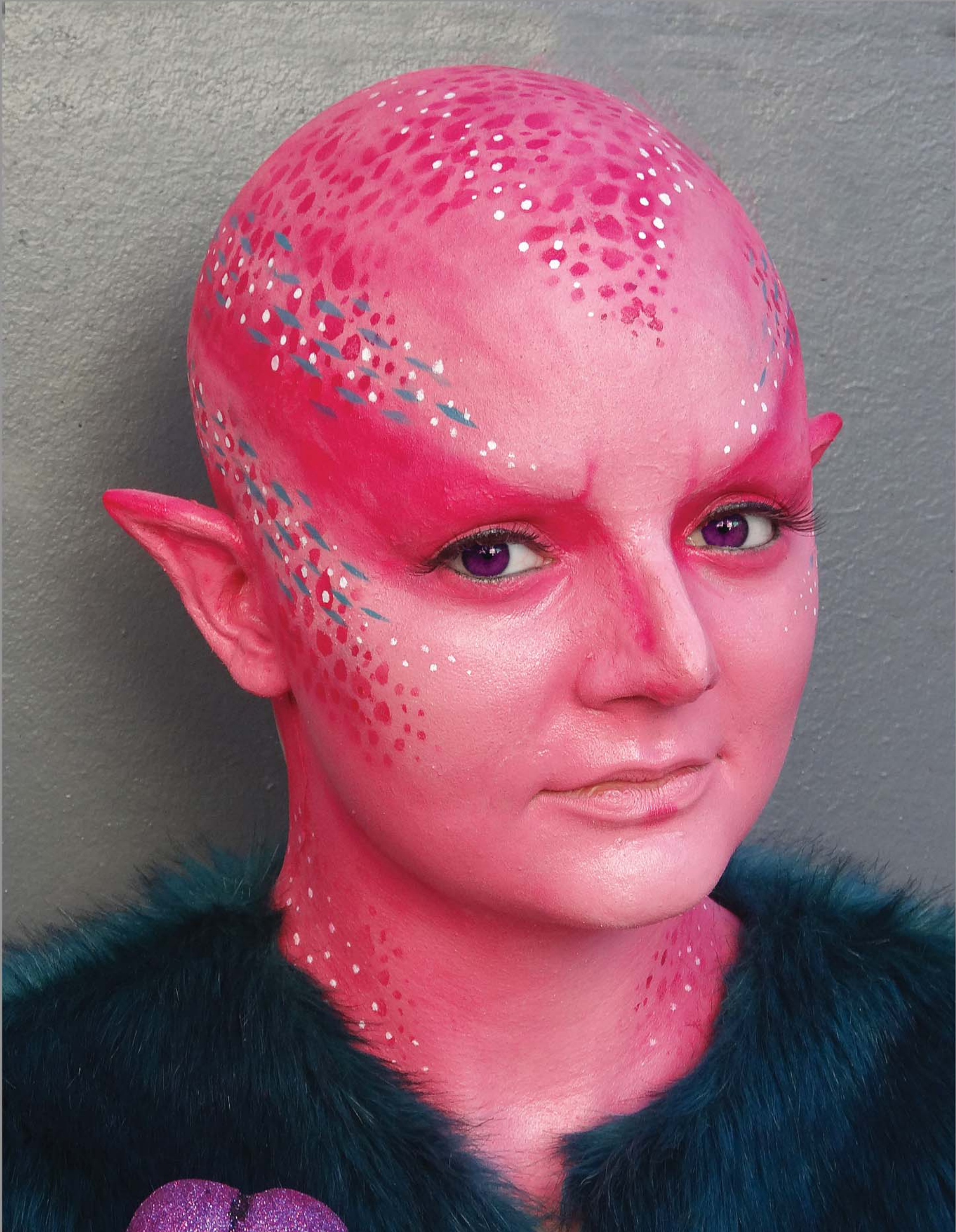
Fabricated and Applied Latex Bald Cap