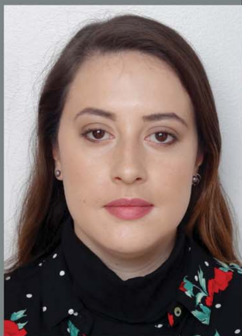
Fabricated and Applied Prosthetics, Hand-punched eyebrows, Hand laid facial hair