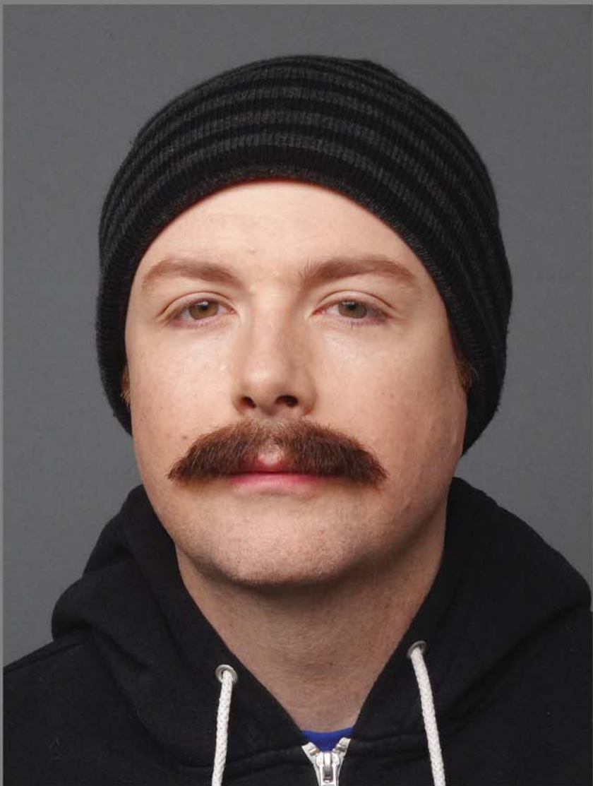
Ventilated and Applied Moustache