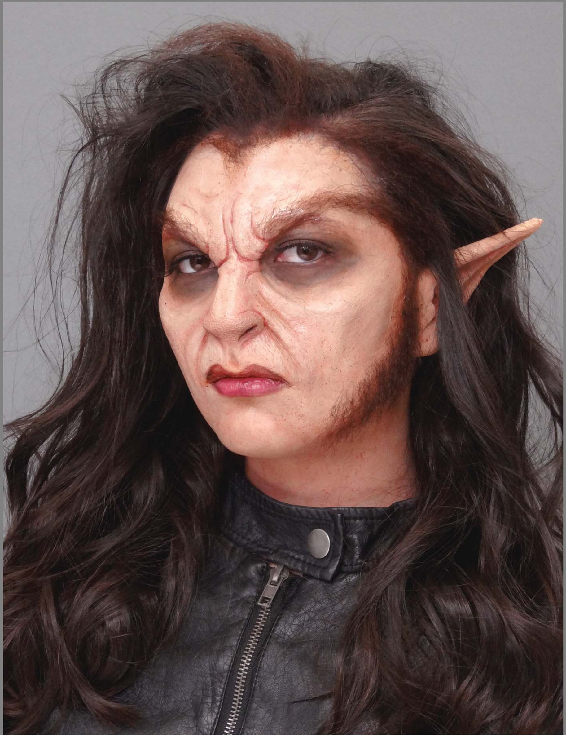
Fabricated and Applied Prosthetics, Hand-laid Eyebrows and Facial Hair