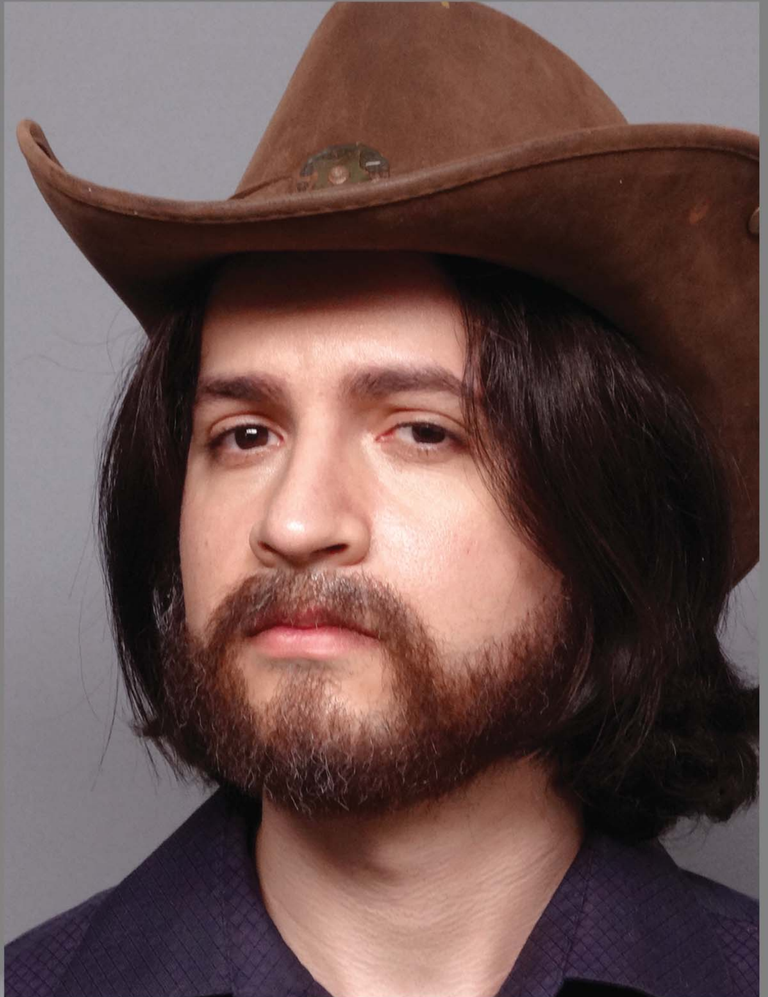
Hand Laid Beard